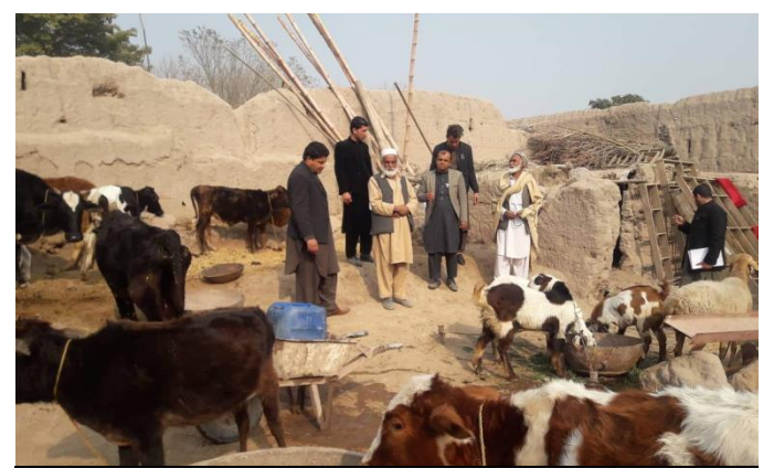
Figure 7: Assessment of Animal Husbandry Management

Through Animal Husbandry Management and Dairy Processing component of this project, capacity of 505 farmer families was enhanced on best practices of animal husbandry management, dairy value added activities, dairy value chain management and preservation of milk. As a result, each beneficiary household was able to generate AFN 5,200 from selling fresh milk to MCCs and/or local markets.