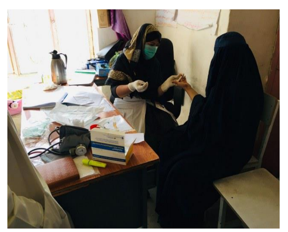
Figure 2 Malaria Diagnosing Test Via RDT at health facility