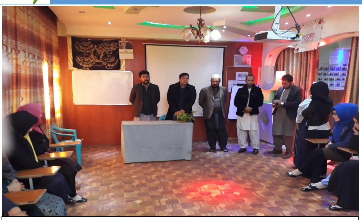
Figure 3: Monitoring visit to ORCD's Community Health Nursing Education (CHNE) School in Ghazni