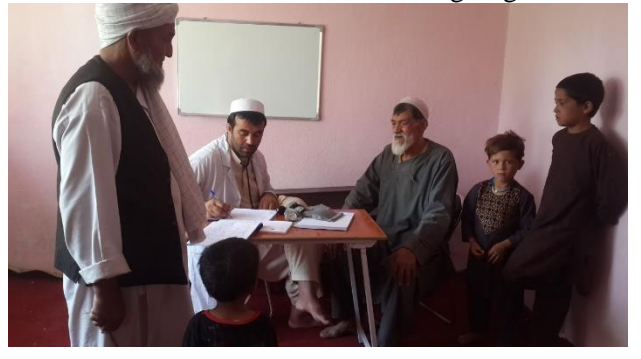
Figure 1 Patients examining in Mobile Health UNIT

As a result of the successful implementation of this project, IDPs and returnees in target