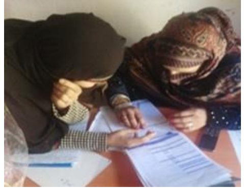
Figure 1: PHP Monitoring Visit

Additionally, monthly incentives were paid to Private Health Practitioners based on their achievements.