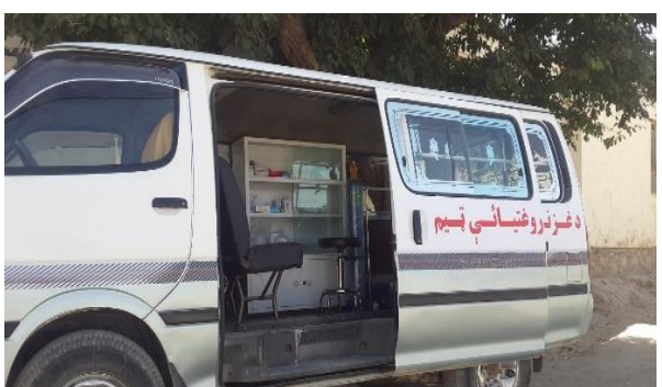
Figure 2 Mobile Health Team Ambulance is ready for the field