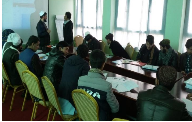
Figure 2 Question and Answer of Participants