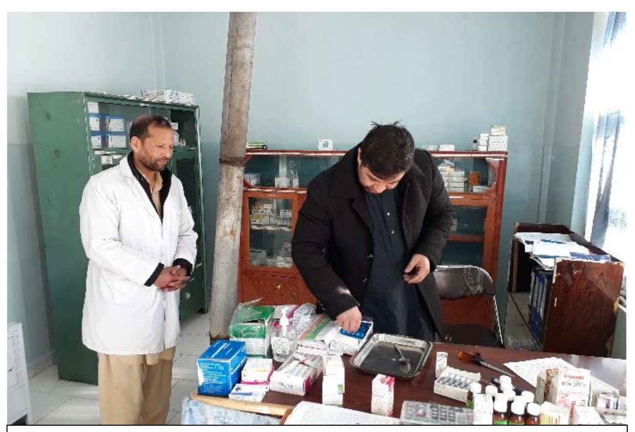
Figure 2: Senior staff of ORCD and GCMU during Monitoring & Supervision Mission to HFs in Ghazni Cluster I