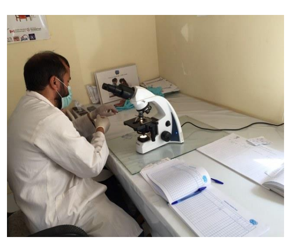
Figure 3 Microscopic Examination of Malaria at health facility