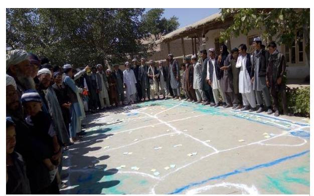
Figure 3:Community Triggering Event in Saripul Sozma Qala District