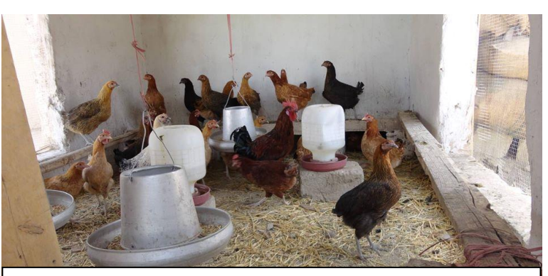
Figure 6: Backyard Poultry Farm established through BADILL

Through backyard poultry farming, 600 families were able to generate AFN 4,800/month on average from selling fresh eggs in local markets for eight months during 2018. This component of the project proved very effective in empowerment of women as the money earned from Backyard Poultry Farms went to women's pockets.