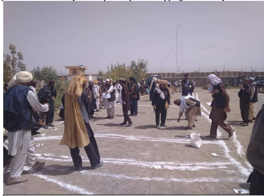
Figure 5: CDC clustering process in Yahya Khel district of Paktika

The project progressed smoothly in Yahya