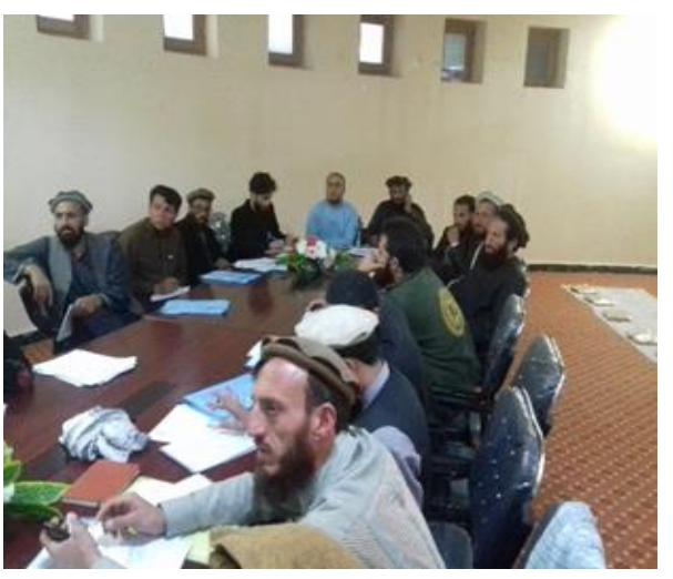
Figure 3 Rational Medicine use training