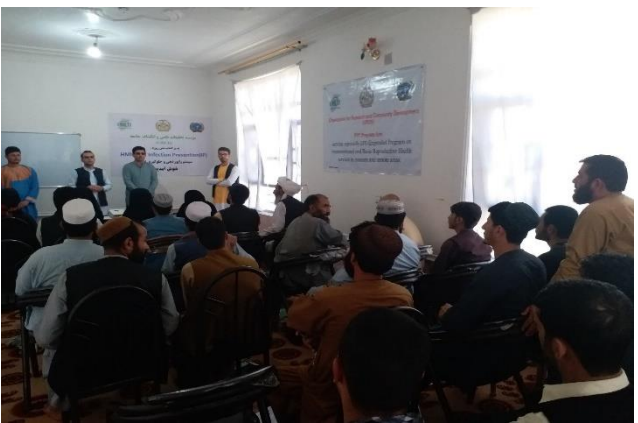
Figure 2 HMIS/IP Training in Farah Province