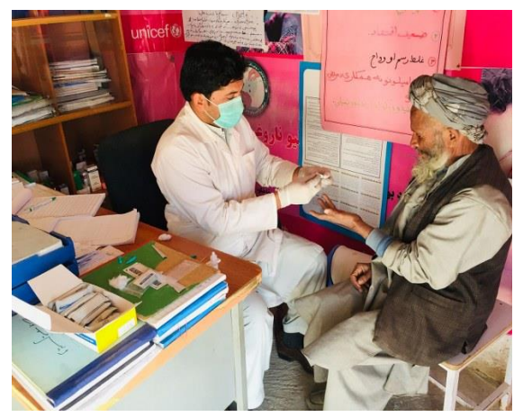
Figure 1 Malaria Diagnosing Test Via RDT at health facility

ORCD maintained effective coordination with all relevant stakeholders at national and provincial levels. Also, provincial FPs were provided MLIS training and the system was applied in the HFs of Zabul province. However, FPs of Sar e Pul province were recently trained on MLIS and the system has yet to be applied in this province which will occur in the first quarter of 2019.