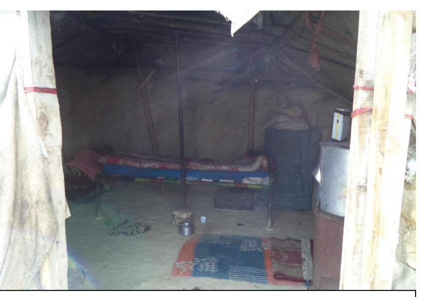
Figure 4: Temporary Shelter of a Refugee Household in Barmal of Paktika province assessed by ORCD's Protection Monitoring Team aimed at identifying needs for Core Relief Items

Through Protection Monitoring, ORCD identified 777 Persons with