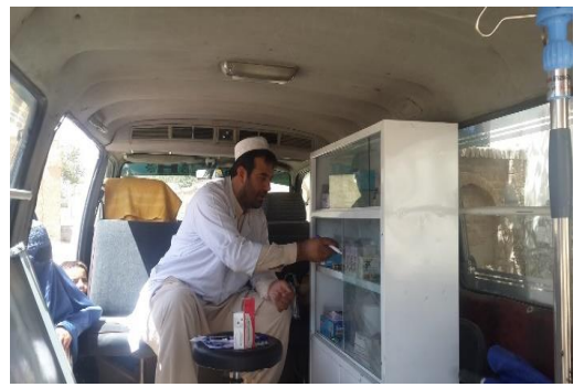
Figure 3 Medicine is collecting and providing to the patients in Mobile Health UNIT