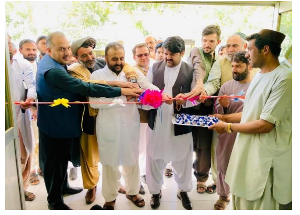
Figure 1 Inaugration of Helmand New PHCC Meeting Hall

All incentives paid to PHPs were calculated based on achievement of proxy indicators against baseline indicators.