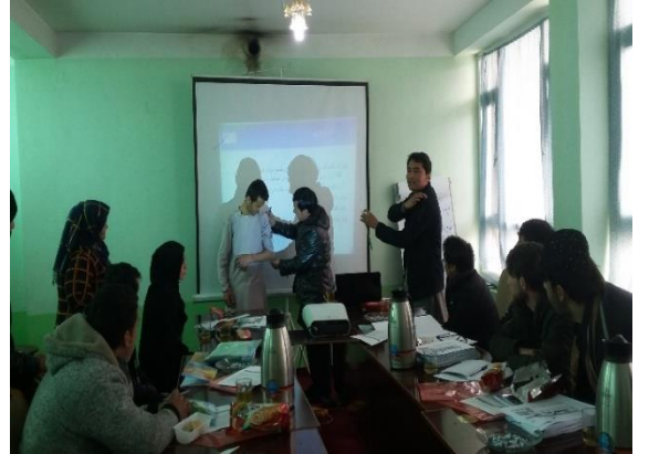
Figure 3 Practical Teaching of bone fracture