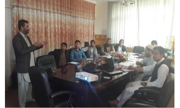
Figure 1: CLTS Orientation training for Project Managers and Master Trainers