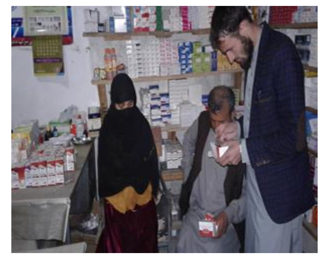
Figure 2 PHP Monitoring Visit