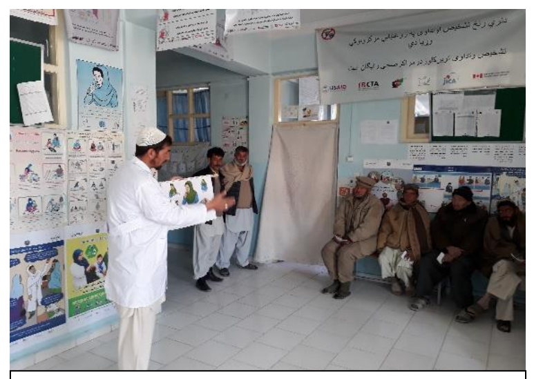
Figure 1: Health Education in Health Facility

In 2018, 531 of 535 Health Posts were functional and 21 SHCs were functional whereas the target was only 4. Additionally, there were 57 functional HFs including 1 CHC+, 13 CHCs, 21 BHCs and one Prison Health Center. The Health Posts encompassed 518 male and 498 female Community Health Workers.