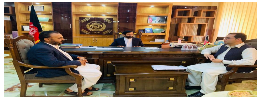
Figure 3 Meeting with Helmand Governor regarding PPP Project Activities in Helmand www.orcd.org.af

Figure 2 HMIS/IP Training in Farah Province