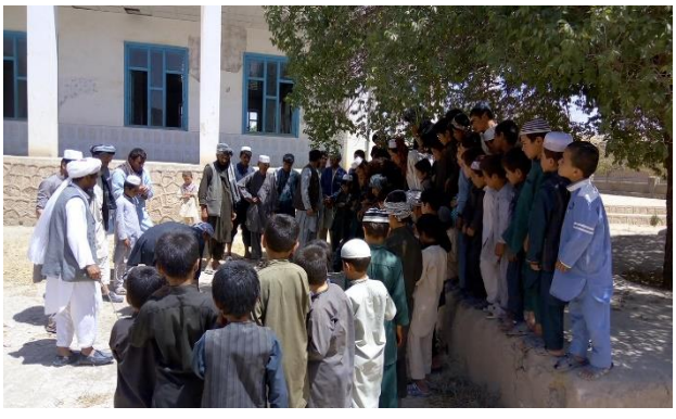
Figure 2 : Community Triggering Event in Zabul Qalat District

j. Celebrations in certified communities