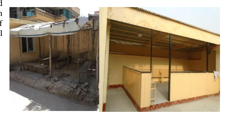
Figure : Kabul Urban Health, Health Facility Waiting Area | before renovation (left), after renovation (right)

ORCD performed joint supervision monitoring missions to Health Facilities together with PPHD, HNTPO, Kabul Urban Cell and other relevant stakeholders.