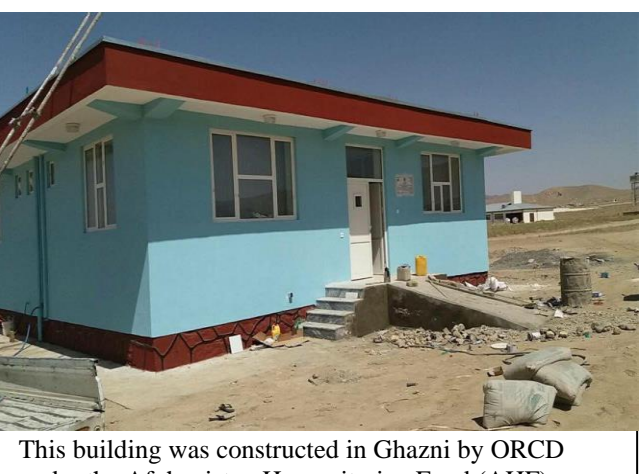
under the Afghanistan Humanitarian Fund (AHF)

Through achieving the expected results of the project, ORCD ensured the provision of health services for conflict affected populations in Ghazni and Zabul provinces achieving all set targets. ORCD provided strong support for timely emergency responses and a total 8,135 war victims accessed lifesaving health services and surgeries throughout the project period positively impacting the health needs of women, men, boys, girls and other vulnerable individuals in coordination with the BPHS program.